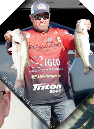
The National Professional Fishing League hosted by the City of Texarkana, Texas and the Texarkana USA Chamber of Commerce held a three-day fishing tournament at Wright Patman Lake. APRIL 2021