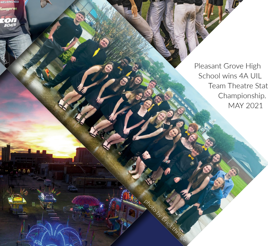
Pleasant Grove High School wins 4A UIL Team Theatre State Championship. MAY 2021