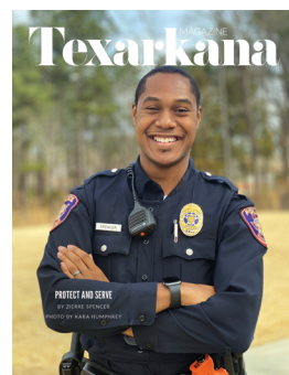
PROTECT AND SERVE March 2, 2021

Get Talk Tuesday delivered to your inbox every week to read more stories like these. Sign up on our website, www.txkmag.com .