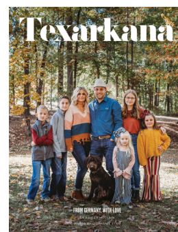
FROM GERMANY WITH LOVE May 18, 2021