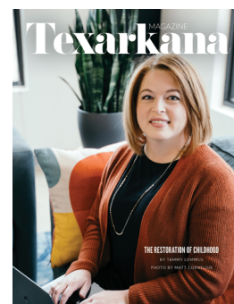
THE RESTORATION OF CHILDHOOD January 26, 2021